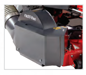
Extra wide 7" diameter outlet hose

The rugged impeller utilises industrialgrade bearings, generating phenomenal airflow for use in heavy and wet cutting conditions. Its spindle-driven vertical turbo is narrower, allowing you to get in and out of tight places.