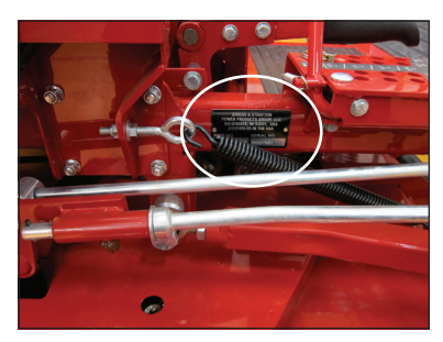
IS® 3100Z PROPANE