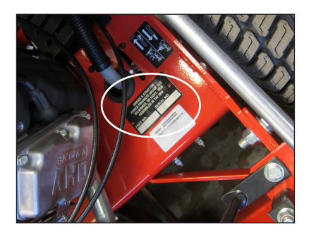
FW35 Plate is located on the engine deck.